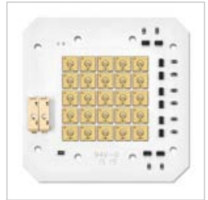
One 5x5 LED Array from Bolb provides powers up to 2.5 W.