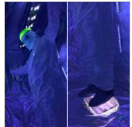
Light shower in the Huoshenshan Clinic, Wuhan, China.