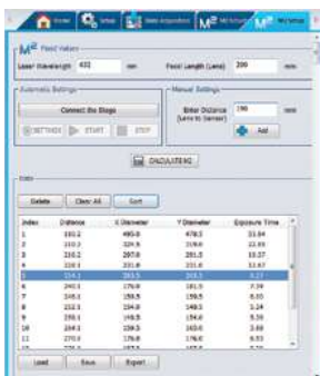
Enter measurement parameters in the M^2 Setup tab.