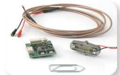
Fig1: Evaluation Pack.

The actuator APA120S can bear load up to 0.5 kg over 140 \mu m and in a compact size. The CA \mu 10 can deliver a voltage up to 150V and has 2 channels.